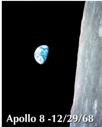
Apollo 8 -12/29/68